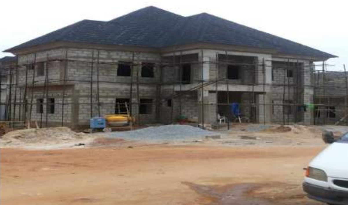
CONSTRUCTION OF 5-BEDROOM DUPLEX AT EFAB MERTOPOLIS ABUJA.