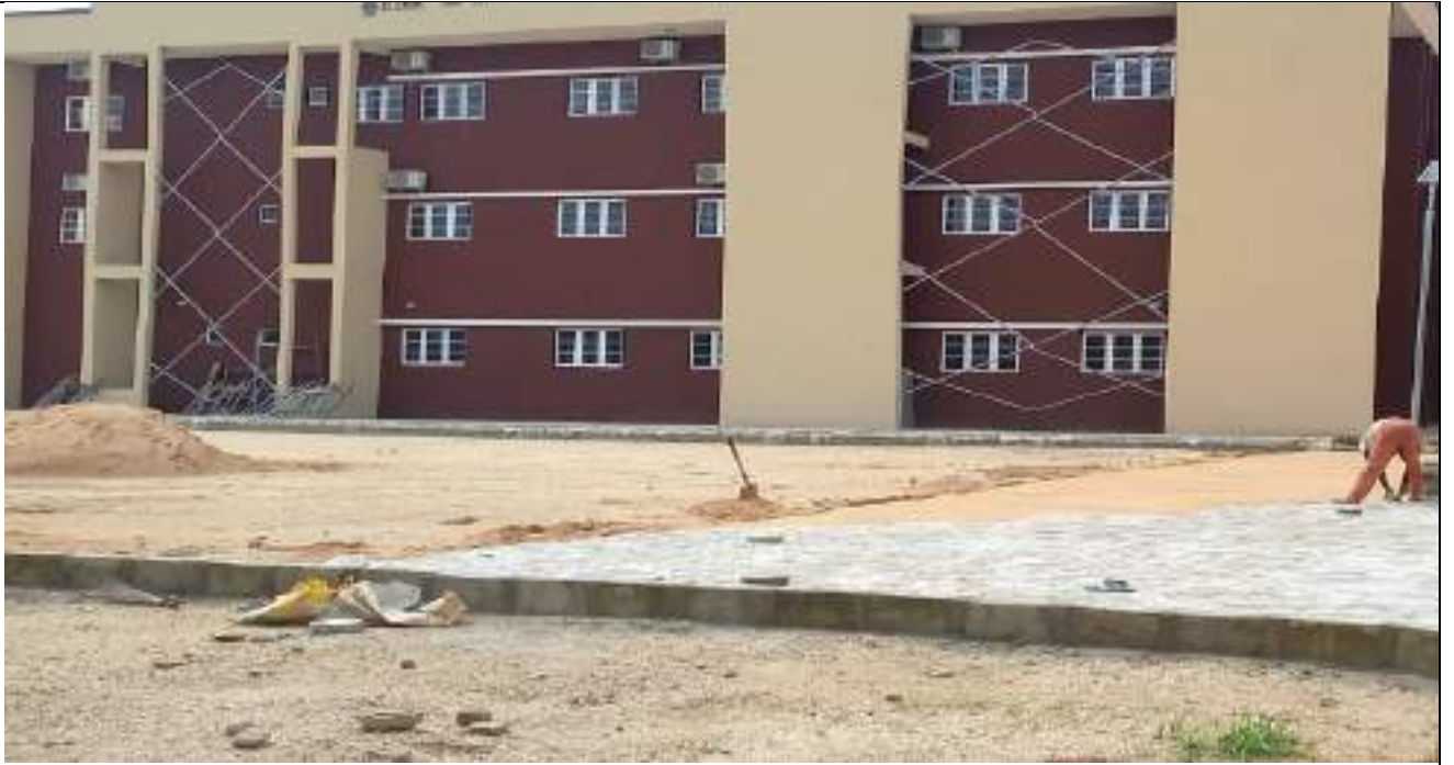
CONSTRUCTION OF FACULTY OF MASS COMMUNICATION