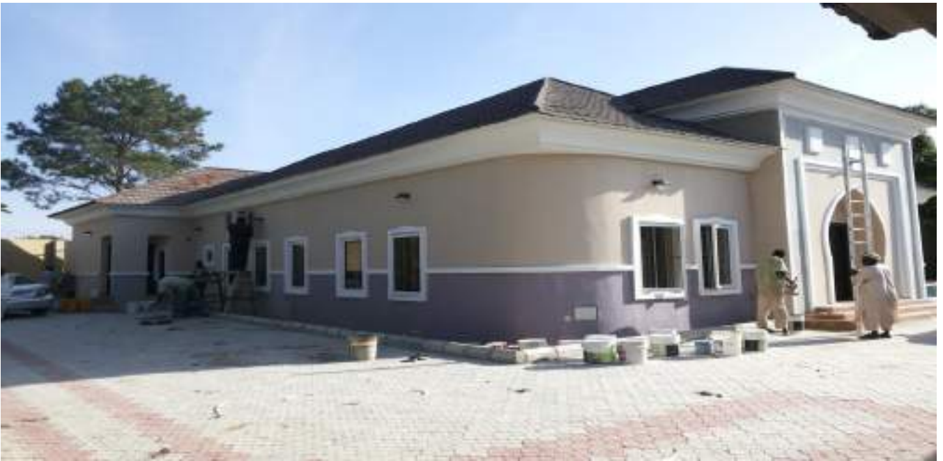
RENOVATION AND REMODELLING OF 5-BEDROOM BUNGALOW AT KATSINA