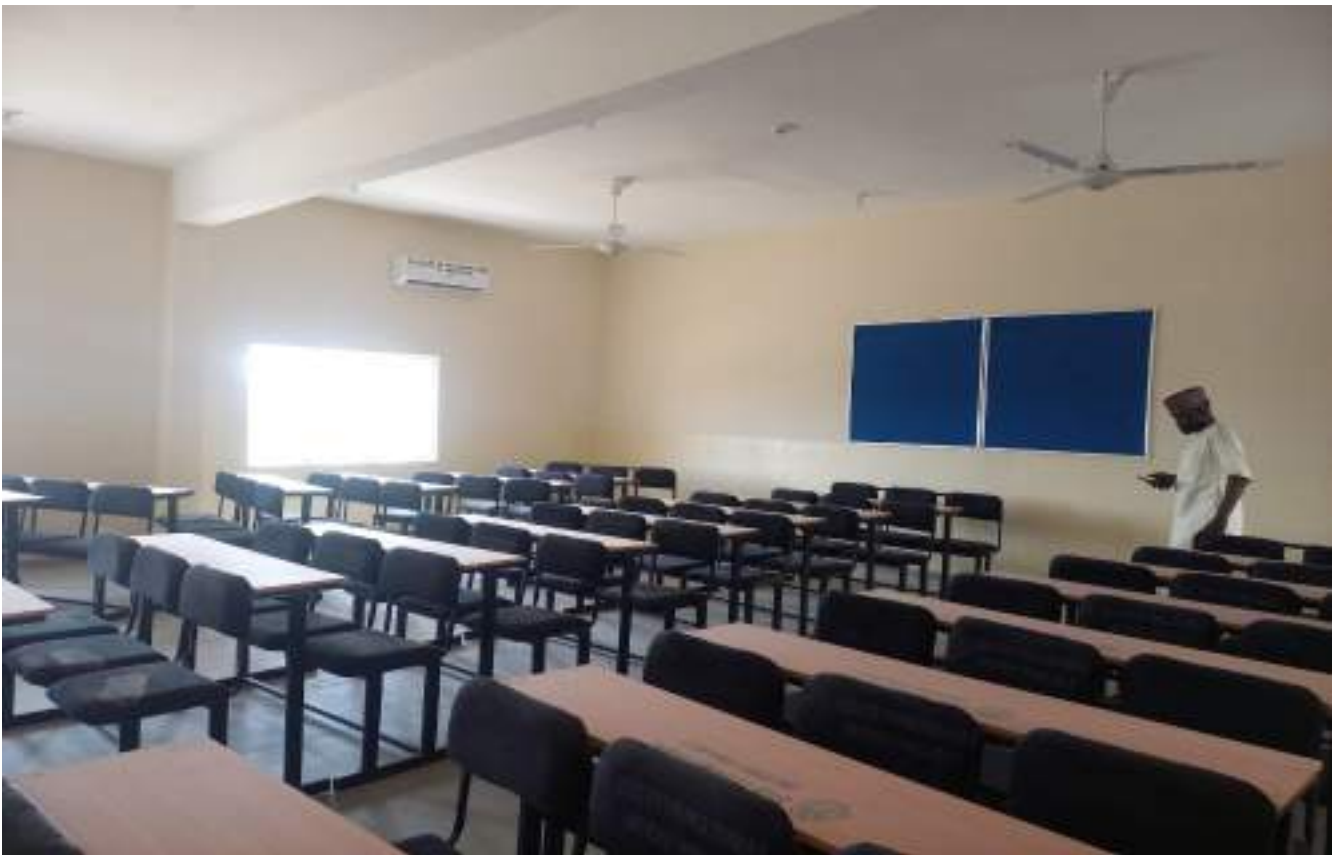
CLASSROOM AT FACULTY OF LAW DEPARTMENTAL BLOCK