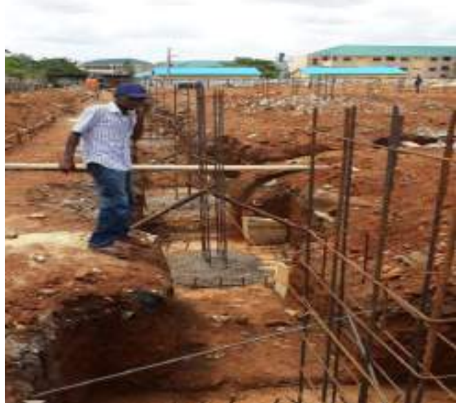
CONSTRUCTION OF BASEMENT