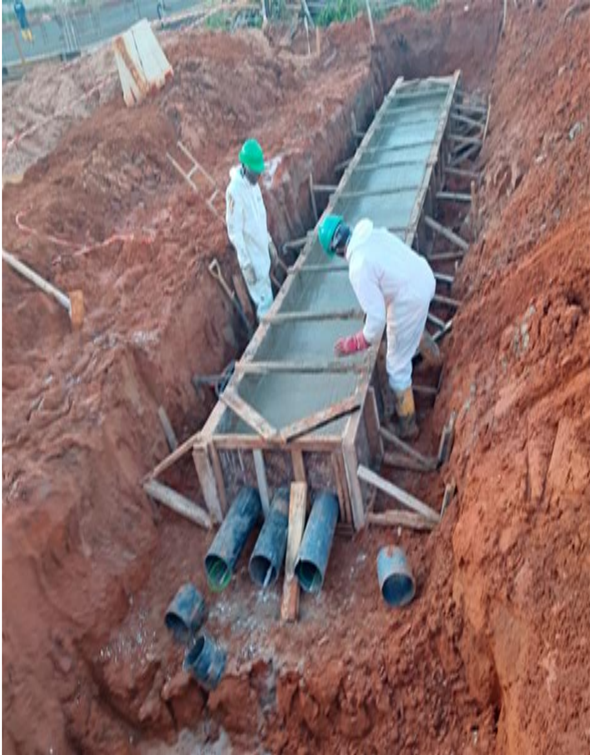
Project: Assa-North Gas Plant, electrical Duct construction Location: Assa-North, Imo Stat