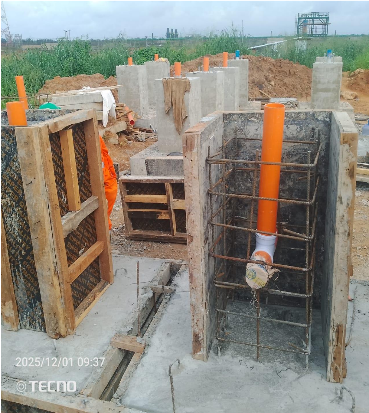
Project: Assa-North Gas Plant, electrical Precast Pole construction Location: Assa-North, Imo State