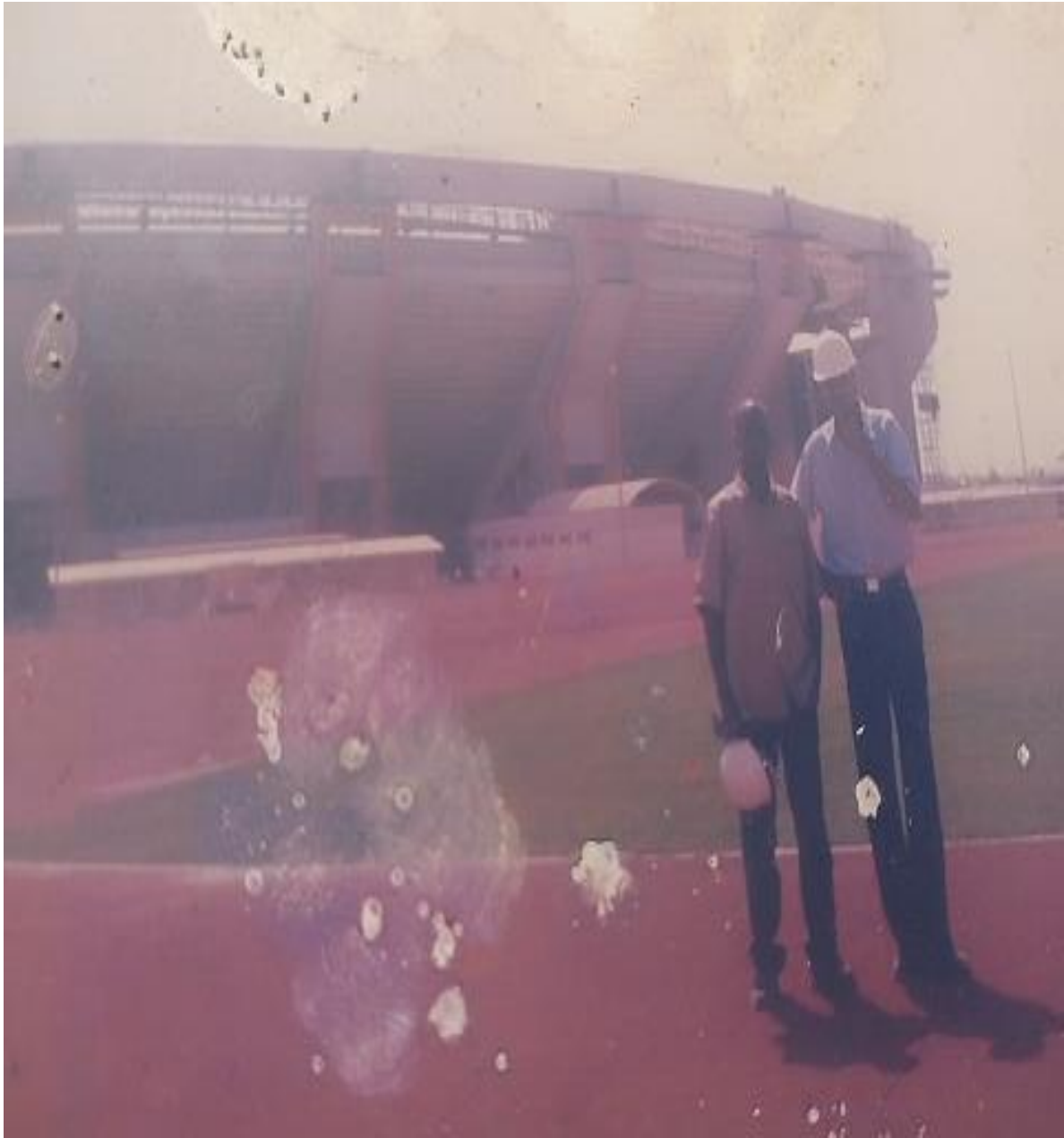
Project: The Construction of the National Stadium Abuja