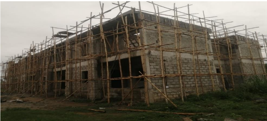
CONSTRUCTION OF NJI BOARD OF GOVERNORS RESIDENCE ABUJA