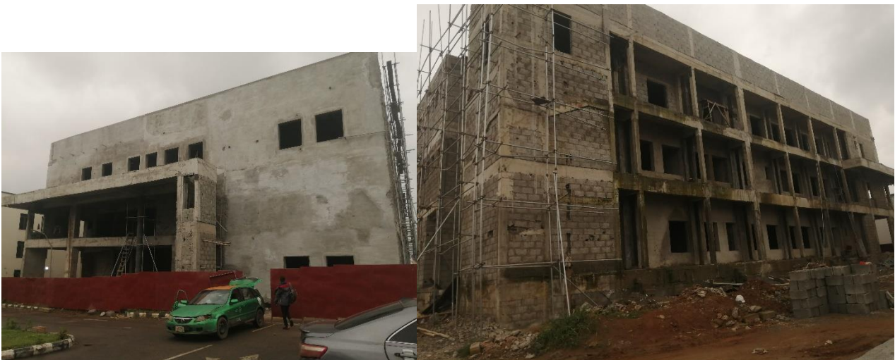
CONSTRUCTION OF DRC INNOVATION CENTER PHASE 2 ABUJA