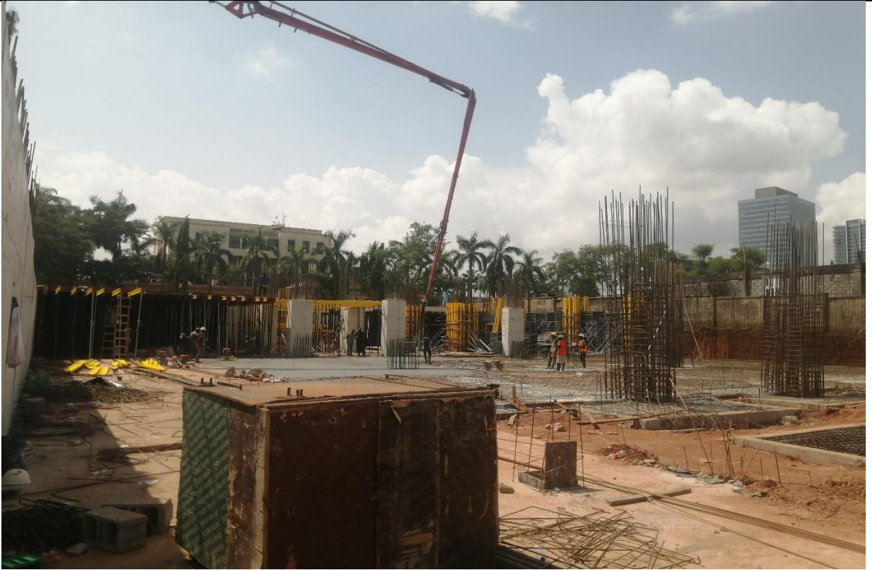
CONSTRUCTION OF MSHEL INNOVATION CENTER