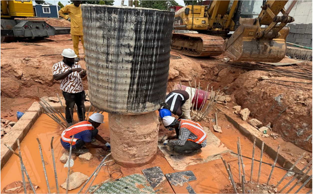
PILE TEST FOR THE CONSTRUCTION OF MSHEL INNOVATION CENTER