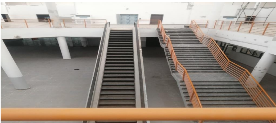
CONSTRUCTION OF MABUSHI BUS TERMINAL ABUJA