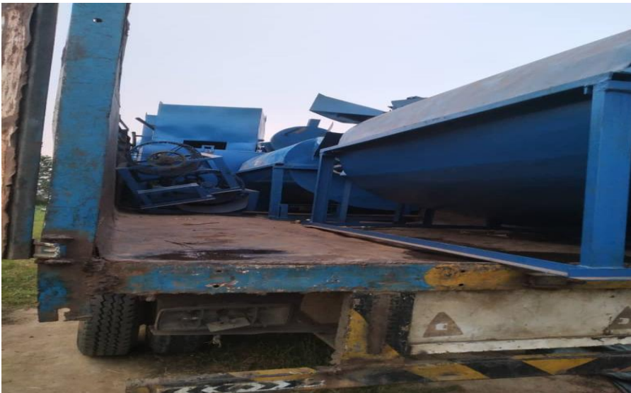
SUPPLY AND INSTALLATION OF PALM OIL PROCESSING EQUIPMENT AT RIVERS STATE