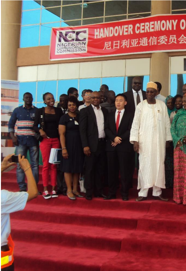
NCC- DBI HOSTEL AND RECREATIONAL FACILITIES ABUJA